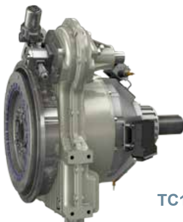
TC14 - 311 R